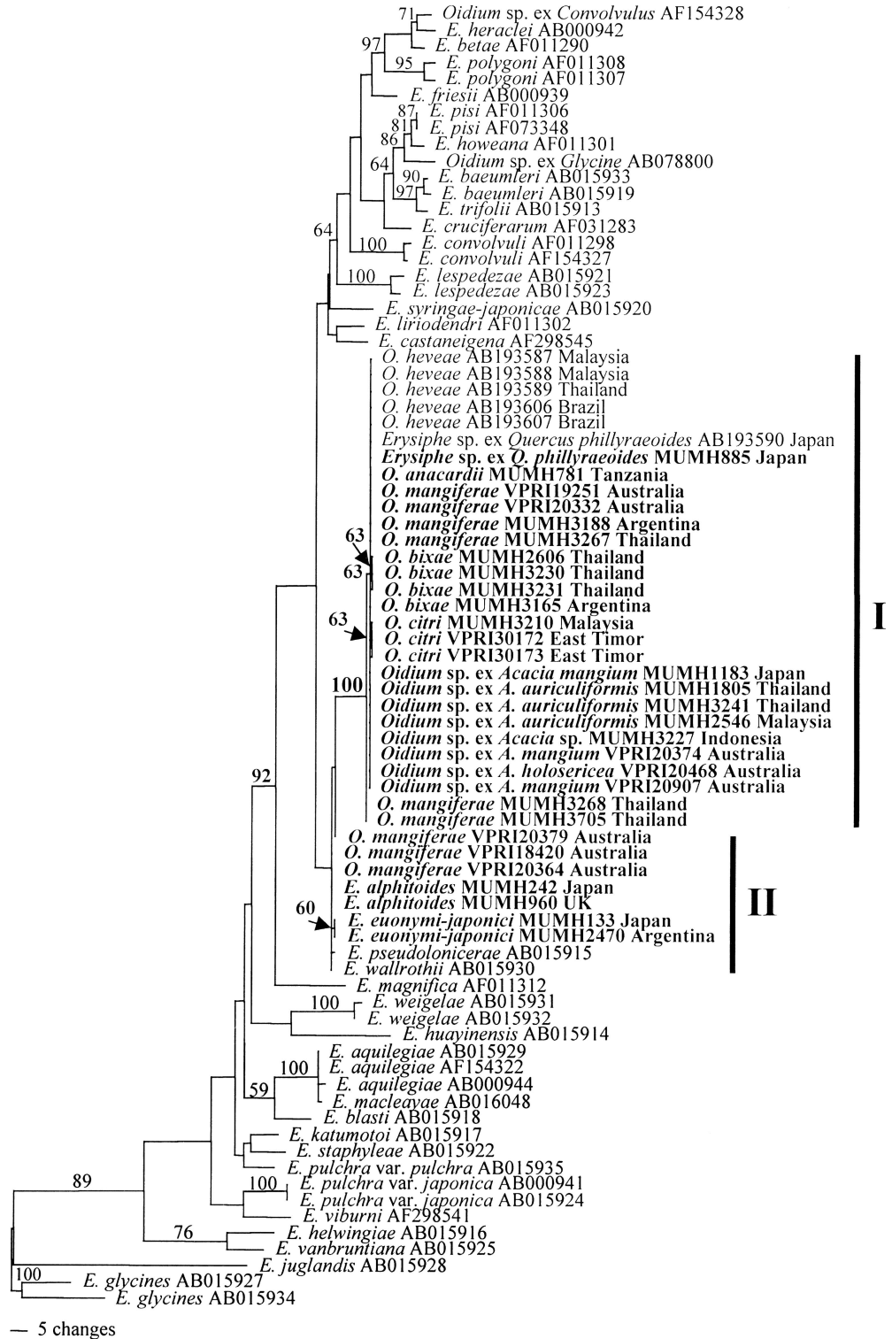
Fig. 1. One of the most parsimonious trees based on the internal transcribe spacer (ITS) sequences from 77 taxa of Oidium subgenus Pseudoidium . The tree is also the maximum-likelihood tree among the 119 equally parsimonious trees with 531 steps. The tree was obtained by a heuristic search employing the random stepwise addition option of PAUP*. Gaps were treated as missing data. Percentage bootstrap support (1000 replications) is shown above branches. Roman numerals at right of the tree show groups of powdery mildew fungi sequenced in this study. Two specimens of Erysiphe glycines were used as outgroup taxa. Sequences newly determined in this study are shown in boldface . CI = 0.5650, RI = 0.8064, RC = 0.4556

anacardii , Oidium sp. on Acacia spp., O. heveae , one O. bixae , and four O. mangiferae sequences, and differed only in one base to the sequences of two O. bixae from Thailand, O. citri from Malaysia and Indonesia, and two O. mangiferae from Thailand. Group II comprised three O. mangiferae sequences collected in Australia, E. alphitoides